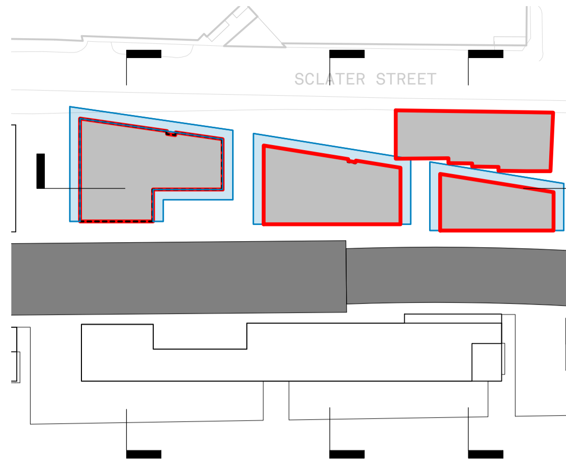
PLOT 5_PODIUM 1 : 750