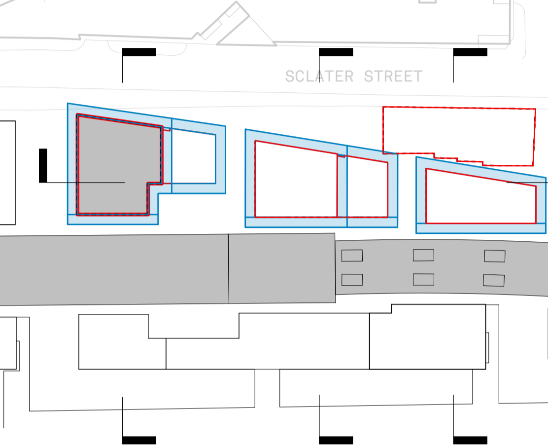
PLOT 5_ LEVEL 11 1 : 750