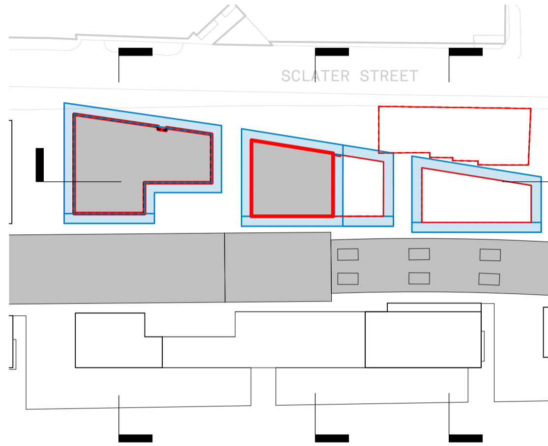
PLOT 5_ MID UPPER 1 : 750